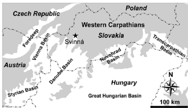
Fig. 1. Geographic localization of the studied area. White – Neogene basins.